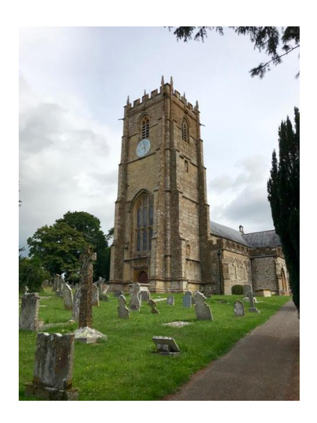
Beautiful local church - worth a visit