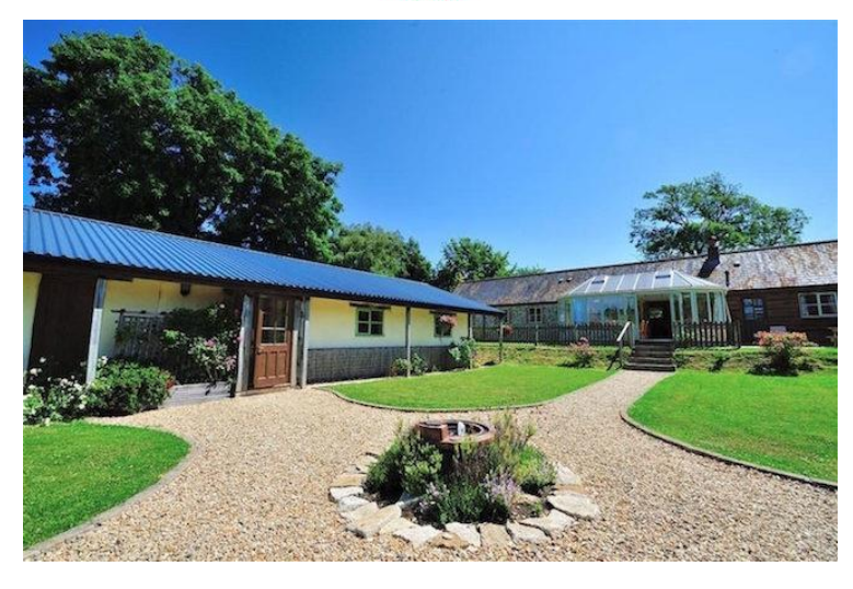
The meditation centre and pool entrance