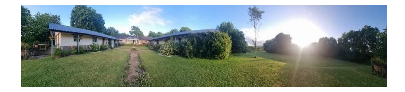
A peaceful tranquil place awaits you