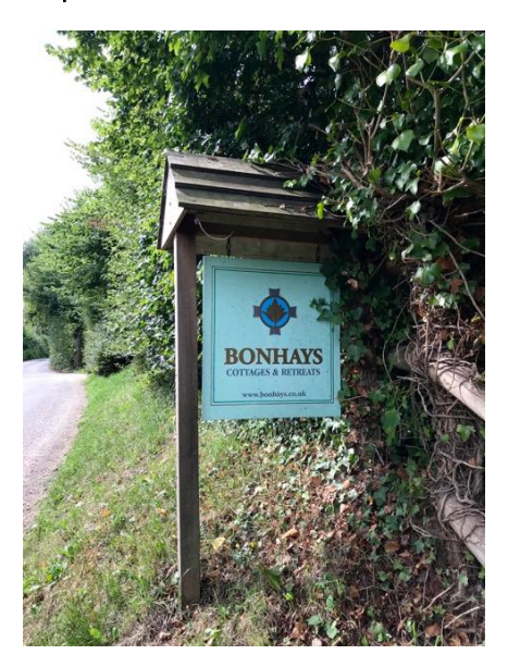
Look out for this sign when you arrive